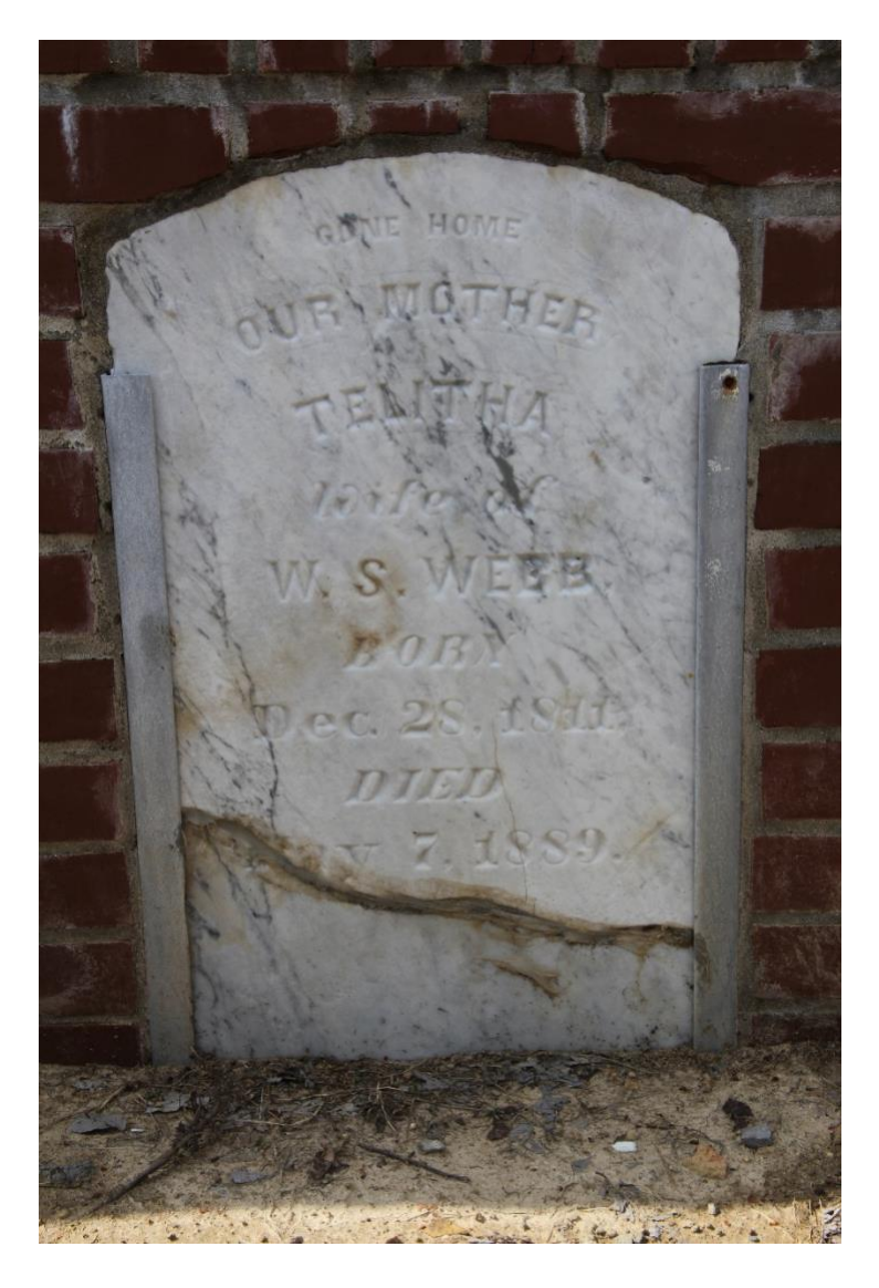
This is what the WSW head stones look like now. I am told that the White House TN Historic Society did this and is caring for the stones.